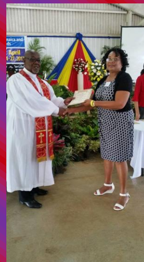
Moderator makes presentation for stewardship