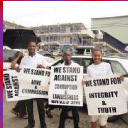
Gathering of delegates at the Fesco Petrol Station in Mandeville, singing songs of praises and witnessing to members of the public on Mission Day.