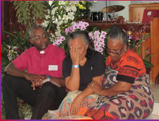
Dramatic Presentation from members of WRMC during their context reading