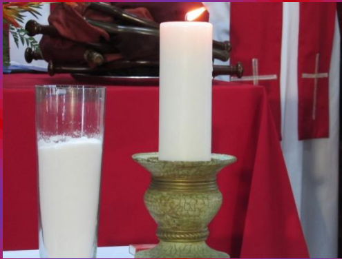
Symbols of Salt and Light