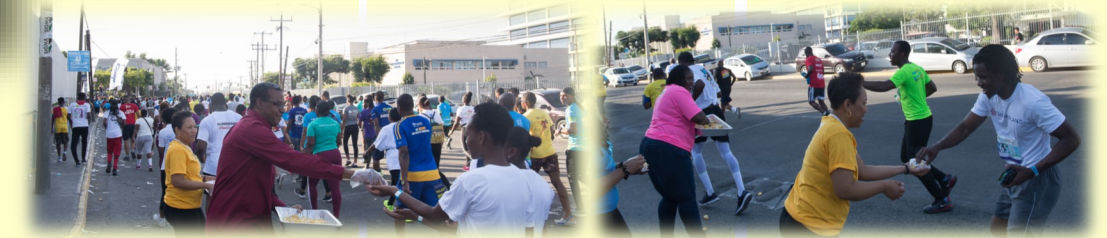
Some Webster members handing out pegs of oranges to Sagikor Sigma Corporate Run participants!