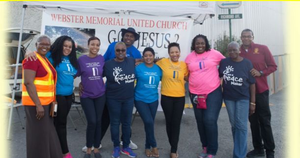
Some members of the innovative team!