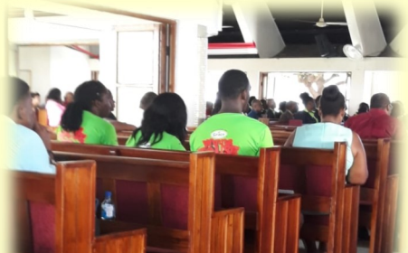
Above: The FRUIT of the Initiative!!! Runners attend the service!!