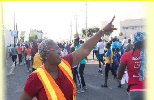
Pointing runners to Webster's service!