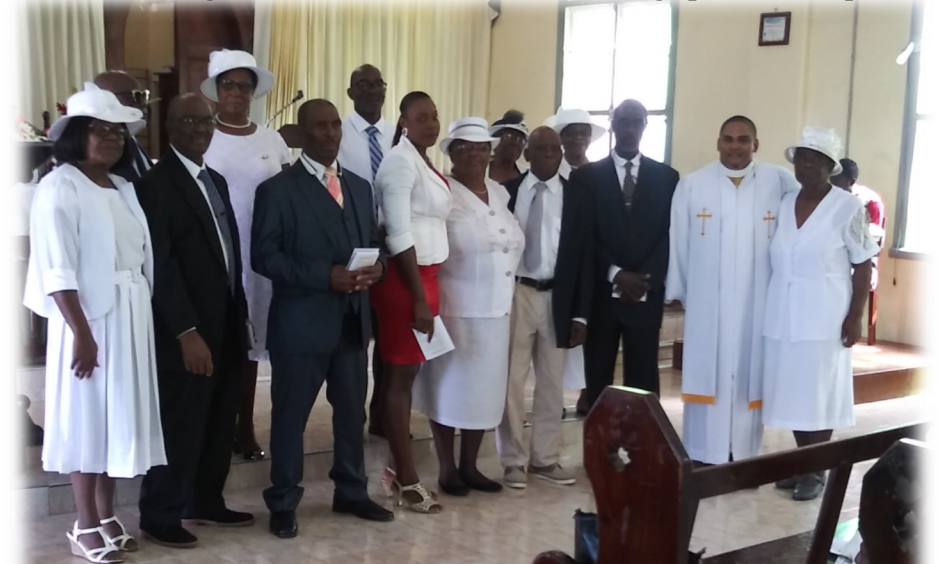
Candidates for baptism at Baillieston United Church, Clarendon (February 17, 2019)!