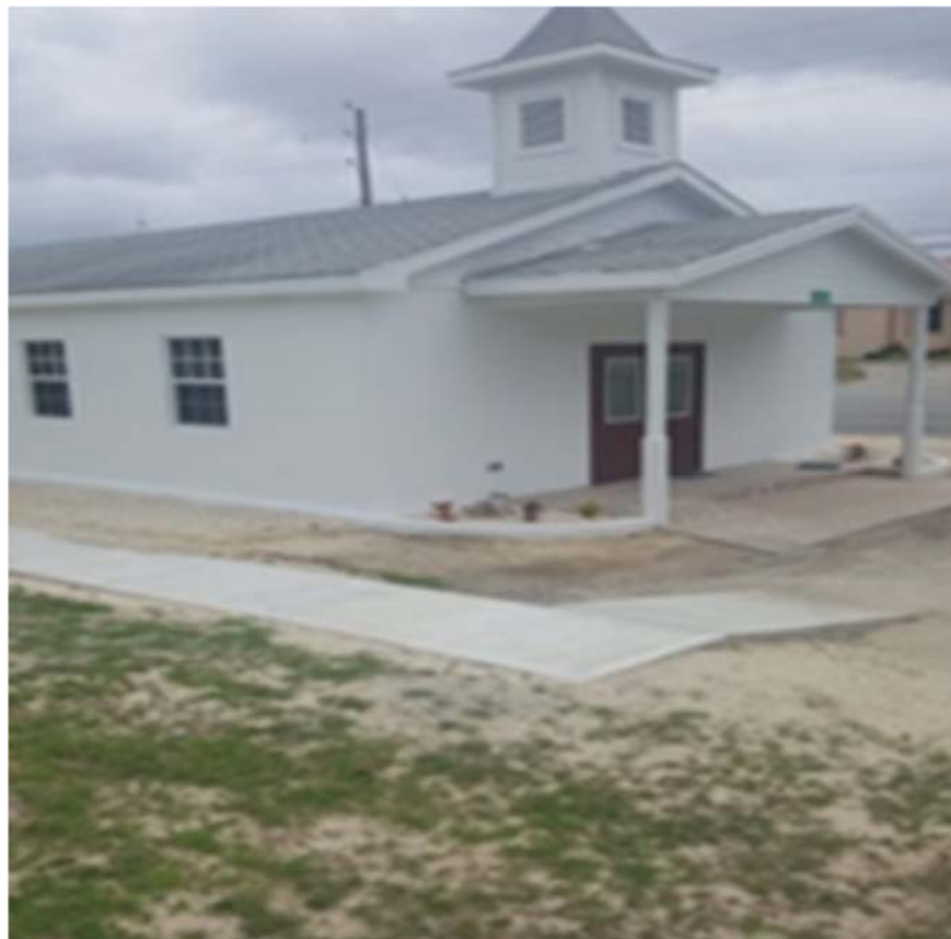
The refurbished Gun Bay United Church