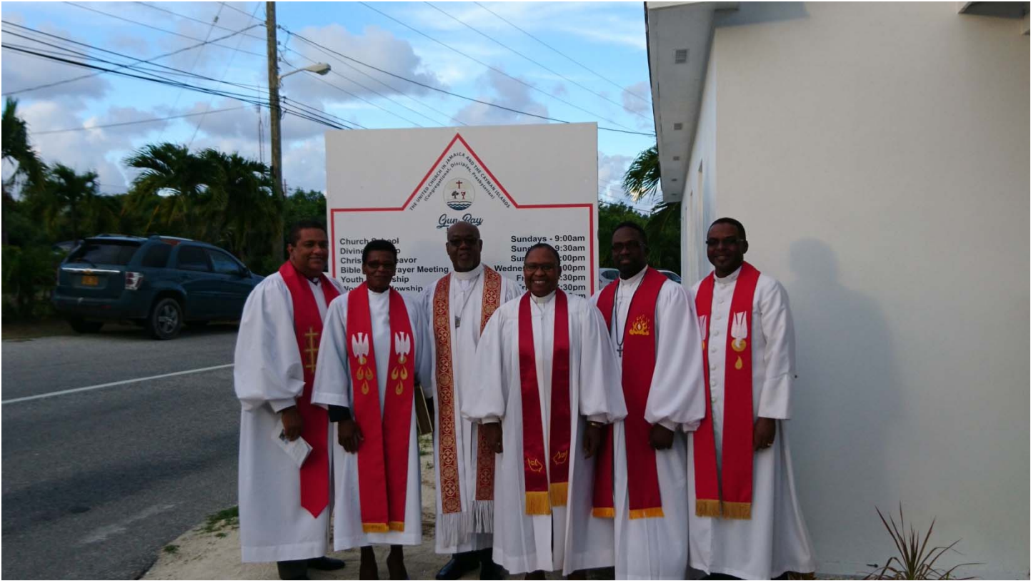
Moderator -3 rd Left with members of the Clergy and the RDGS outside the Gun Bay United Church