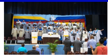
CAYMAN CONVOCATION 2018

The Children’s Village catered to 60+ youth who participated in a series of praise and worship, Bible lessons, and crafts. They discussed the story of Jesus calming the sea and sharing with his disciples about peace. The Bible lesson was merged with the “Fruits of the Spirit”, of which Peace is one. There was also a special storytelling time with the Puppet Ministry from John Gray Memorial United Church, which the youth thoroughly enjoyed. The young people (Teens) shared in a time of devotion and reflection. They focused on “inner peace” through the demonstration of a sponge soaking up water. They were encouraged to soak up good and positive things so that in times of hardships, when they are squeezed, peace and positivity will be released.