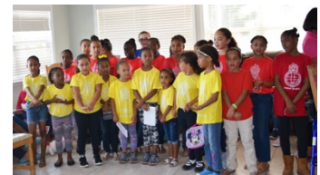
GIRLS’ BRIGADE VISITS PINES