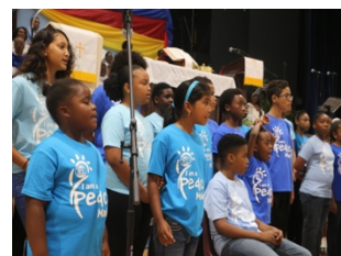
Combined Children's Choir