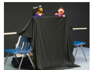
John Gray Memorial Puppet Ministry