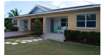
CIRMC DEDICATES MISSION HOUSE

The theme for Convocation “Disciples of Peace” inspired the worship, prayers, and overall fellowship of the day. Read about some of the highlights of the Convocation Service.