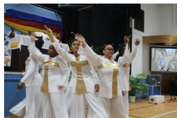
Elmslie Memorial Dance Ministry