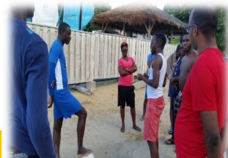
Young Adults and Youth Representative minister to football players on the beach