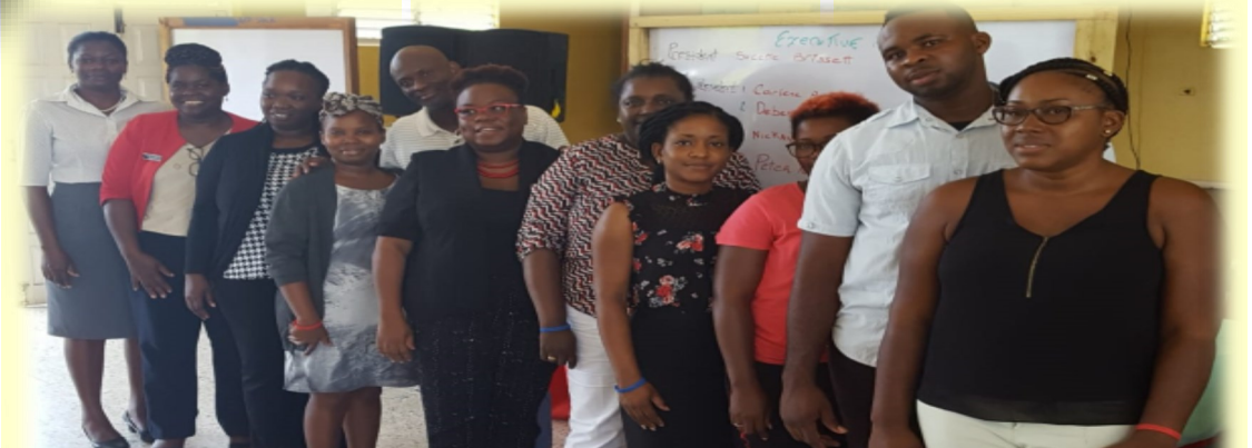
The new UCYAAM Executive, elected at the Conference on August 18, 2018 (Please see names on Page 2)