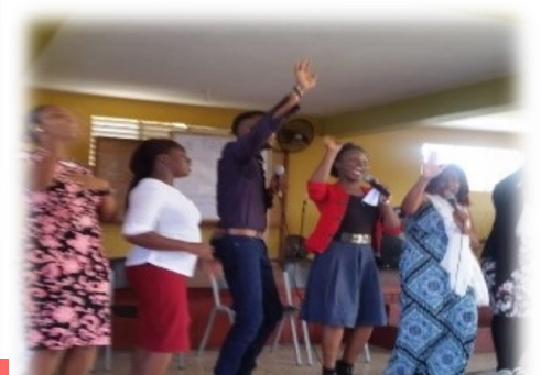
Presentation by the Music Family

The new Team now takes the baton, and we are already thankful for their spirited approach!