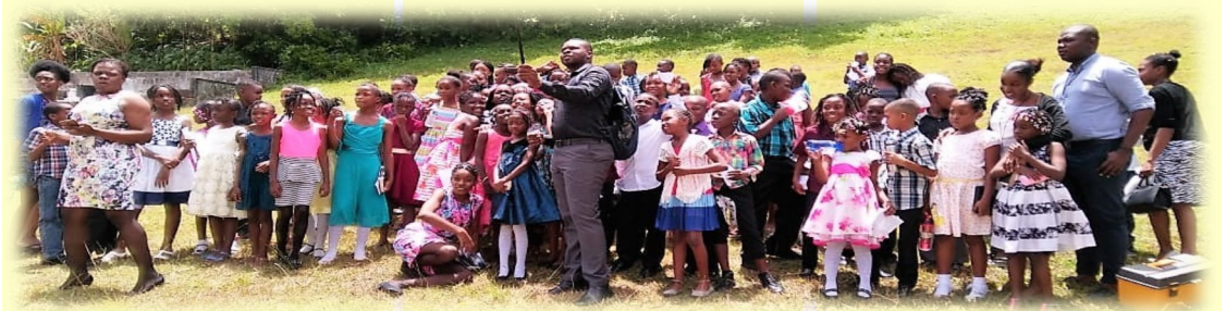
The Campers at Lauriston United Church, St. Ann