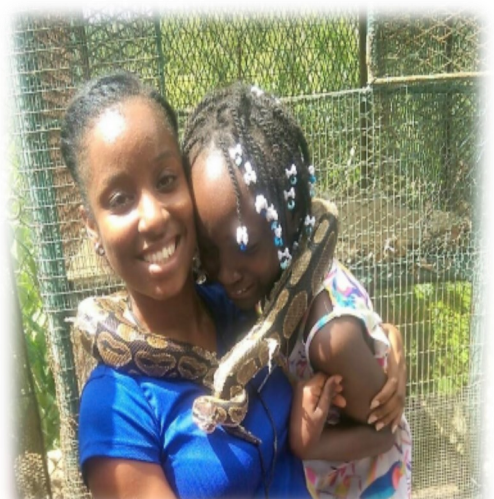
Cuddling with a snake!!

(Dedicated to: The Leaders and Campers of Iona Children's Camp '77)