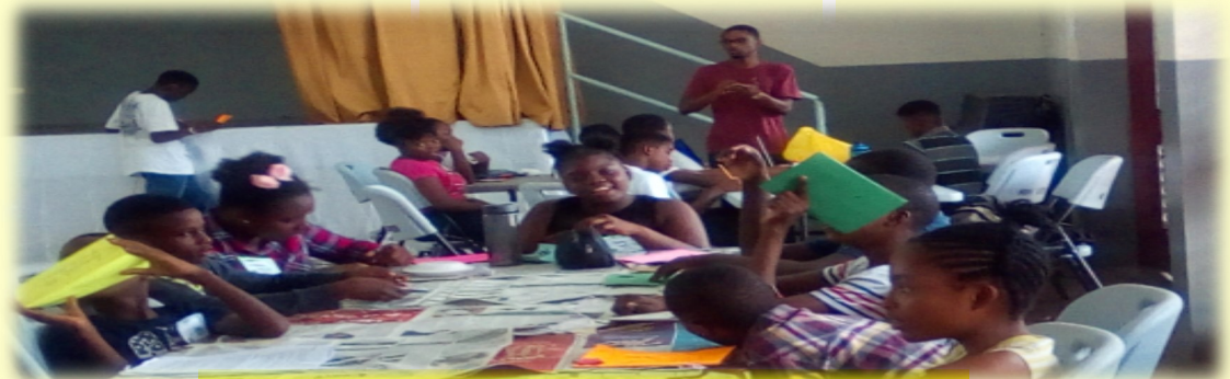
Participants at Hope United Church's VBS 2018

Besides the fun art classes, sporting activities, concert, prize-giving exercise, and bible studies, many of the children came away with a greater sensitization to, and appreciation of, the needs of the disabled community, while both groups had another opportunity for further adaptation based on the environment and its attendant requirements. In this respect, it was indeed a life-enhancing experience for all. To God be the glory.