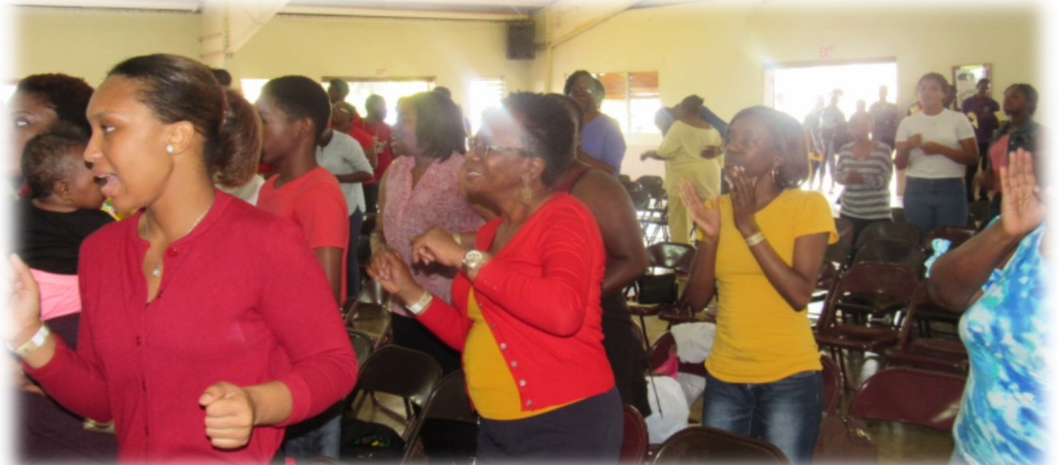
The congregation in praise