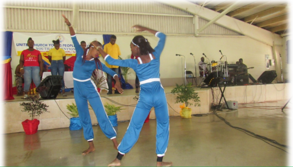
Youth in dance

“The United Church represents a people called by God, to love and worship God as Creator, Jesus the Saviour, and the Holy Spirit the Comforter; to make a difference in people’s lives by actively loving and serving those around us; to bring the good news of the Gospel to all people; to nurture each other in faith; to pursue God’s justice and peace in all areas of life, so that ‘God’s kingdom may come on earth as it is in heaven.’”