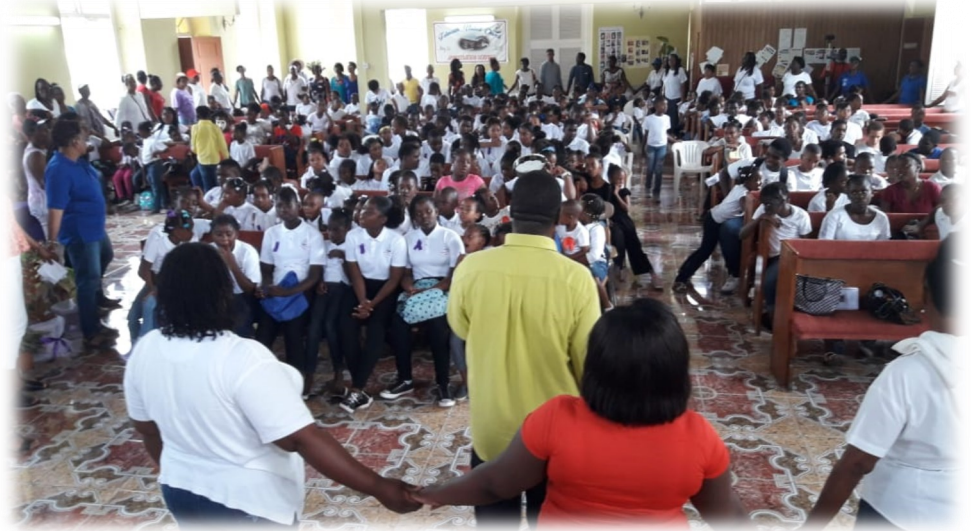
The Church School Teachers form a circle around the children and pray for them

May the creative, inspired children of our Church continue to be blessed and a blessing to their communities! They are, indeed, our future.