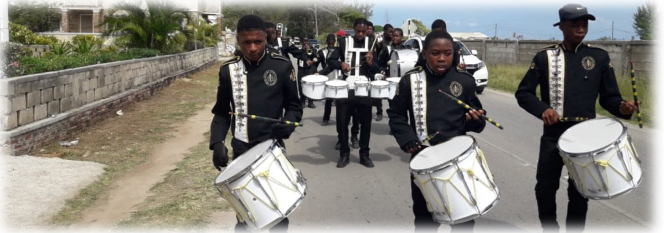
The Trelawny All Stars Marching Band leading the Witness March