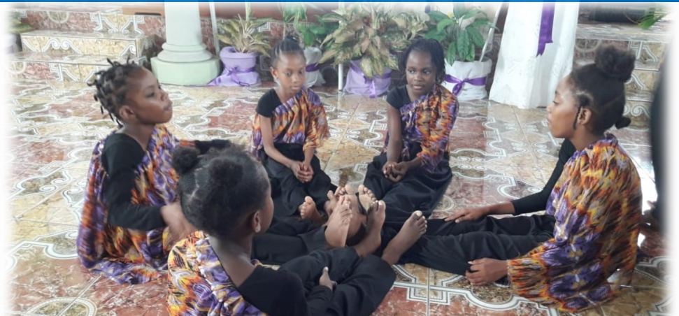
St. Paul's United (Montego Bay) Church School dancers