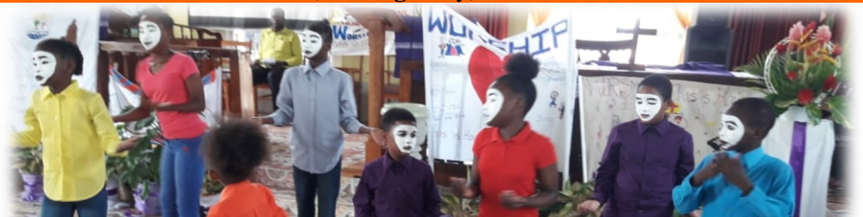
The Savanna-la-Mar United Church School children in mime

Send comments and news about your congregation to: ucjiupdate@gmail.com