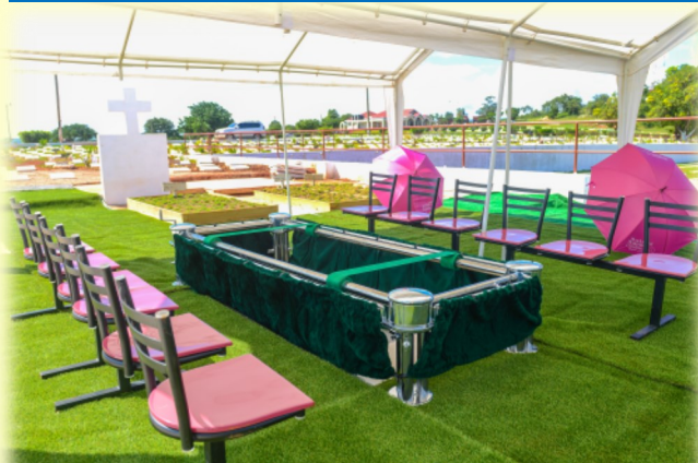
Premium Platinum Vault at Meadowrest Memorial Gardens