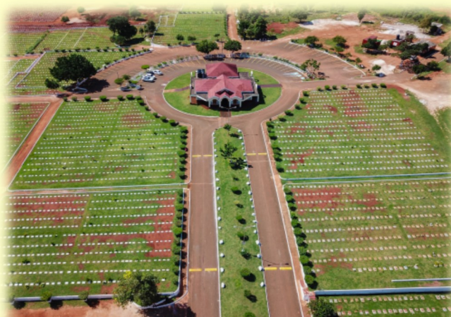
Meadowrest Memorial Gardens