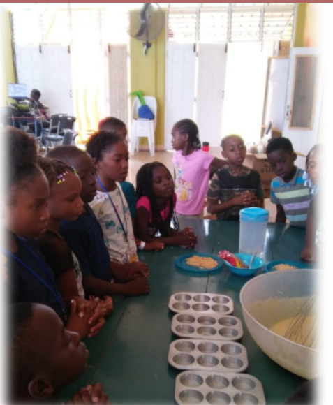
Culinary Arts training for the children!