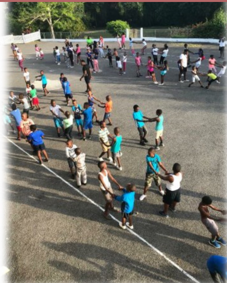
The children during exercise session

FAMILY —Family is a gift from God. As we grow in relationships, we encounter God through each other, and are strengthened to live for God in the world (Psalm 127:3-5, 128:3-4, Ephesians 5:22-33, 6:1-4).