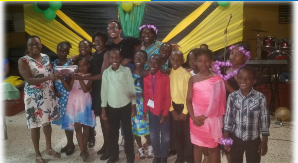
The Winning Family—Movers for Christ!

Send comments and news about your congregation to: ucjiupdate@gmail.com