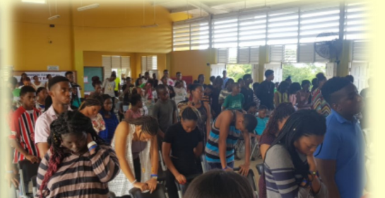
The campers in prayer during the commitment service