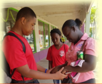
Camp evangelists pray with a passer-by in Ocho Rios