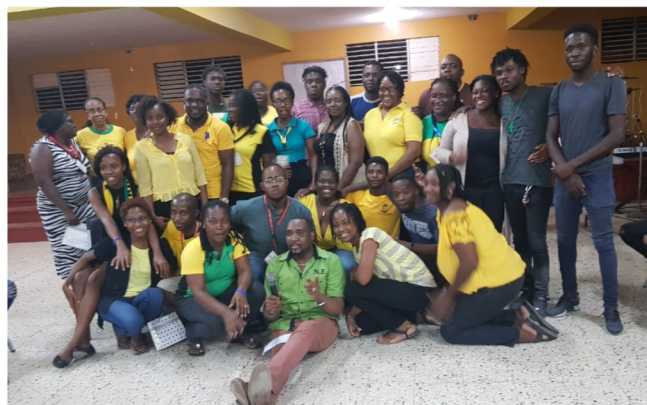
Some of the Discovery Teens 2 Camp 2019 Leaders

“The 21 Indispensable Qualities of a Leader” by John C. Maxwell