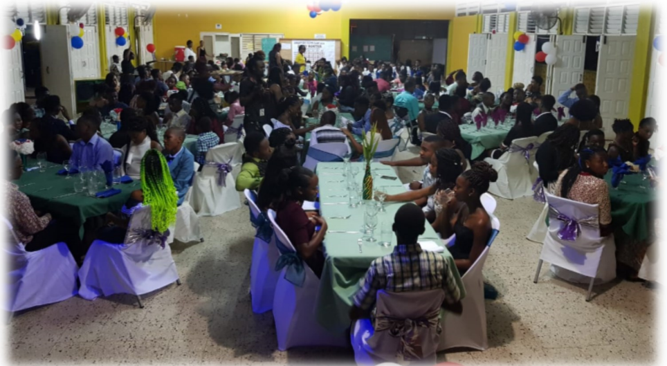
Above: Campers at their Banquet; Below: Some members of the Evangelism Ministry

SPIRITUAL DISCIPLINES (PRAYER, FASTING, WORSHIP, etc.) - Personally and corporately communing with the Triune God—Father, Son and Holy Spirit—attributing honour and seeking after God’s heart, to be empowered for ministry (Psalm 95:1-6, Matthew 6:5-18).