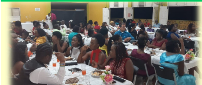
Heels & Tux Banquet