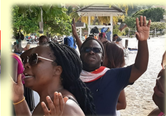
Praise on the beach!