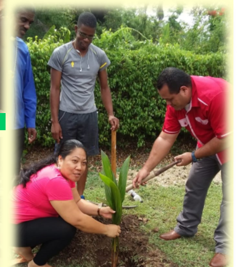
Fruit tree-planting at the camp