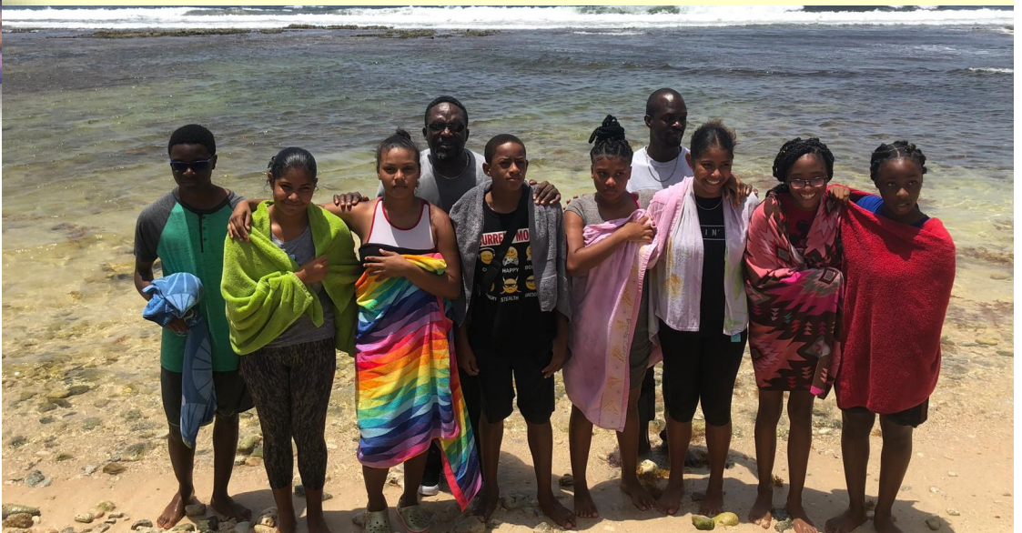
Campers who were baptized during Teens Camp 2019 in the Cayman Islands Regional Mission Council

We thank God for the lives transformed at the camp and for the diligent work of the camp leadership team. To God be the glory!