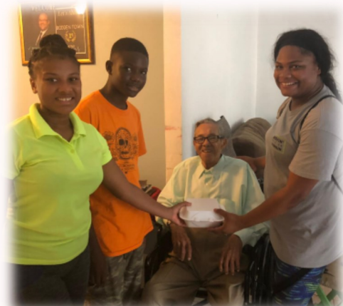
Meals on Wheels!!