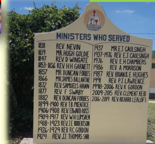
Monument at Stirling United Church to Ministers who have served the Charge.