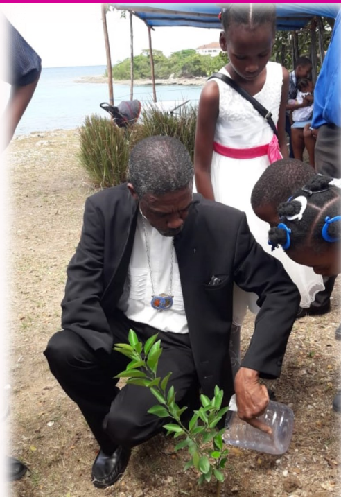
The Moderator plants a tree after the Service at Lance's Bay United Church, Hanover, while children look on