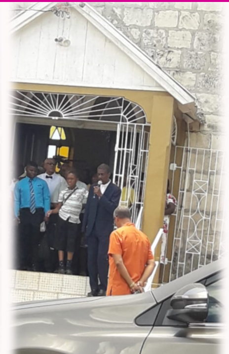
The Moderator engages the people in prayer at Stirling United Church, Westmoreland

Send comments and news about your congregation to: ucjciupdate@gmail.com