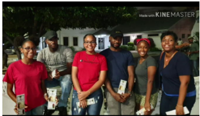
Vlog Outing: Handing out Christmas bookmarkers for Pirates Week.

As a purpose driven, goal oriented spiritual leader she comes with a background in Administration, Childcare Development, Counseling Psychology, Youth and Adult Ministry.