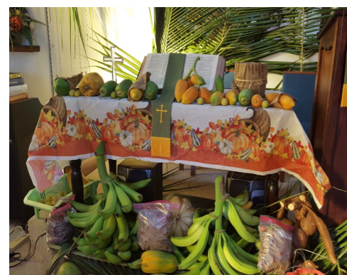
Celebrating Thanksgiving at Robert Young United Church on November 24, 2019.