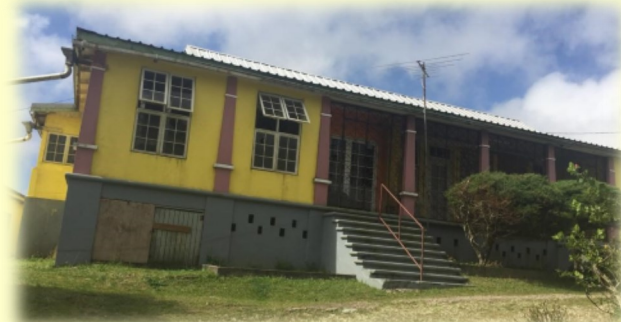
Pringle Home for Children

All of the girls attend school, and currently, one of the girls is the Deputy Head Girl at her institution. Quite recently, one of the girls was the Student Council Representative on her school's Board of Governors, and many have been