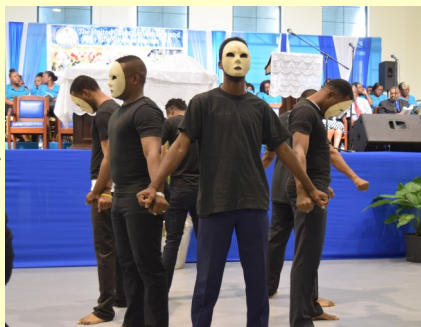
Young men minister at Convocation 2018