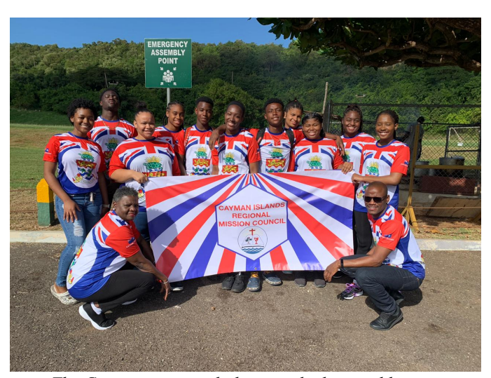
The Cayman team with their newly designed banner

Thanks to the best of the Elmslie United Church's Youth Try, for the first time in over 30 years the Cayman Islands Regional Mission Council was represented at the United Church Young People's Fellowship (UCYPF) National Sports Day held on Saturday, February 8, 2020 at the Noranda Sports Complex, Discovery Bay, St. Ann, Jamaica. Cayman's presence was felt on that ground just like the earthquake we felt in Cayman on February 4<sup>th</sup>. At the end of the event Cayman's medal tally included an impressive collection of 4 Gold, 2 Silver and 3 Bronze medals!