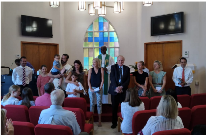
On Sunday, February 16, 2020 eight persons were admitted into membership in the South Sound United Church.