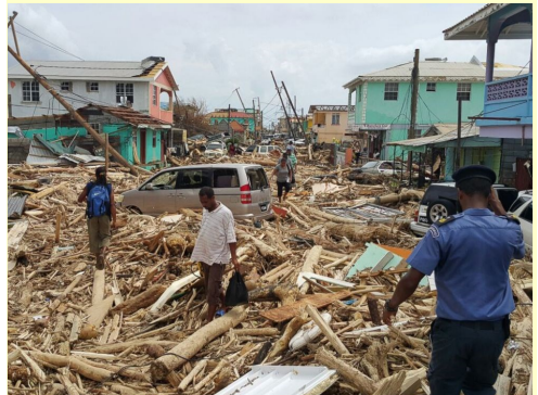
Dominica: The damage on the ground is unspeakable.

The task seems too large, but if we can save one life or help even one family to be rehabilitated , we would have made a contribution.