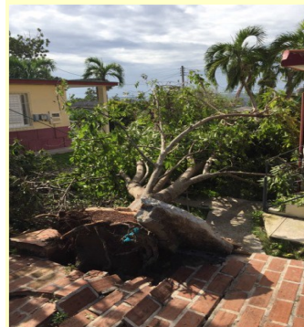
Seminario Evangelico de Teologia, Matanzas, Cuba

United Church NCB (Cross Roads) A/C # 234297392