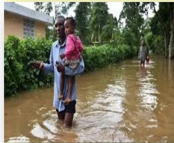
A dazed 'victim' of Hurricane 'Irma' walks in knee-deep flood waters.

This is probably the reason why the reaction from the people of Jamaica who were not only spared from the impact of 'Maria', but also from that of Hurricanes 'Irma' and 'Harvey' that preceded them, have not so far been as compassionate as they could have been.