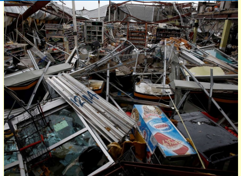
Damage in Puerto Rico, where they are now dealing with the possible threat of additional flooding from a breached dam. Thousands have been forced to flee to higher ground. Nearly 8,000 people live in the areas that could be affected.

At least 24 people have died in the storm, including 15 in Dominica, seven in Puerto Rico and two in Guadeloupe.