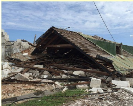
Damage to Turks and Caicos islands.