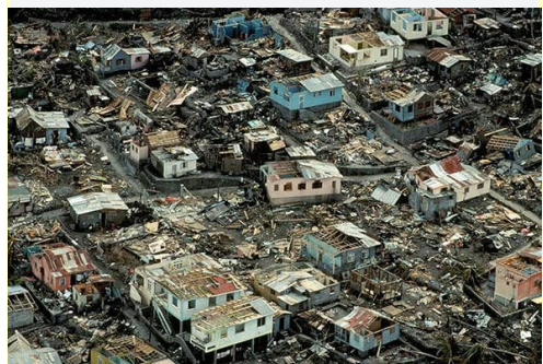
(National Geographic photo).. Dominica from the air. Devastation in Rouseau,

It is against this background the UCJCI through the Cayman Region is making contributions to the Matanzas Evangelical Theological Seminary in Cuba, which suffered significant damage. In Jamaica we continue to encourage congregations to have 'walk up' offerings for the rest of September towards relief efforts for those affected by the hurricanes in the islands of the Eastern Caribbean, as a needed gesture of compassion!