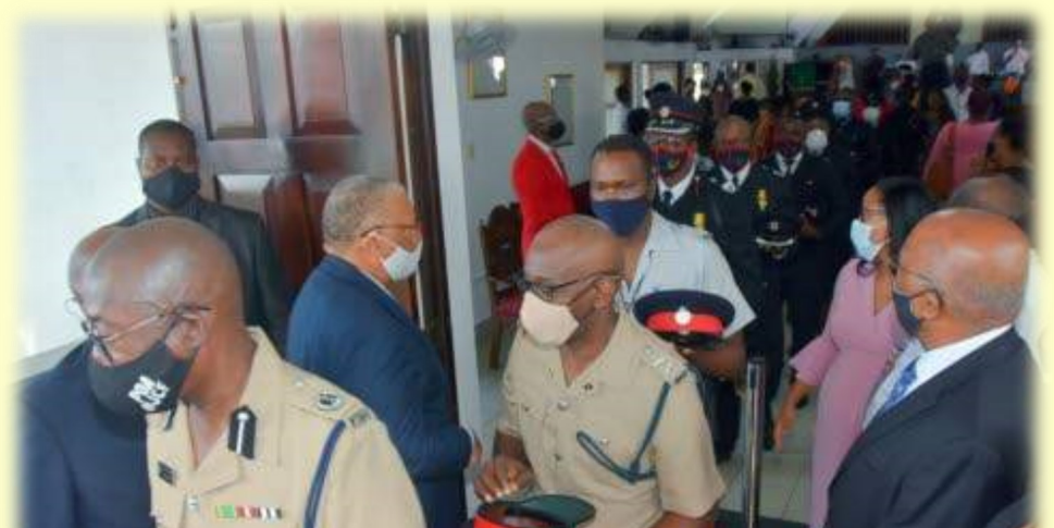
First responders exit the sanctuary.