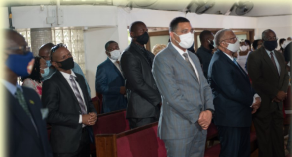
Prime Minister, the Most Hon. Andrew Holness, and Leader of the Opposition, Dr. Peter Phillips, MP, join in the service of thanksgiving.