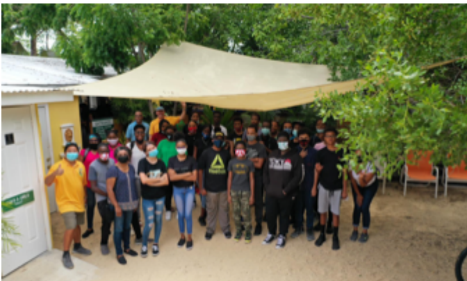
The group of teens from Savannah U.C at the Parrot Sanctuary in East End...