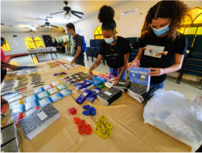
Sorting the school supplies at Savannah U.C. to be donated to needy fellow student at Clifton Hunter High School

Our churches are constantly looking for ways to reach out to their surrounding communities and share God's love in a practical way.