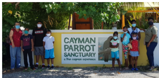
On Saturday August 1, seven primary age youths from Savannah United Church visited the Parrot Sanctuary in East End...

With great care and attention to detail the children and youth in our churches are slowly brought out into the 'open' to do what they enjoy the most: being together.