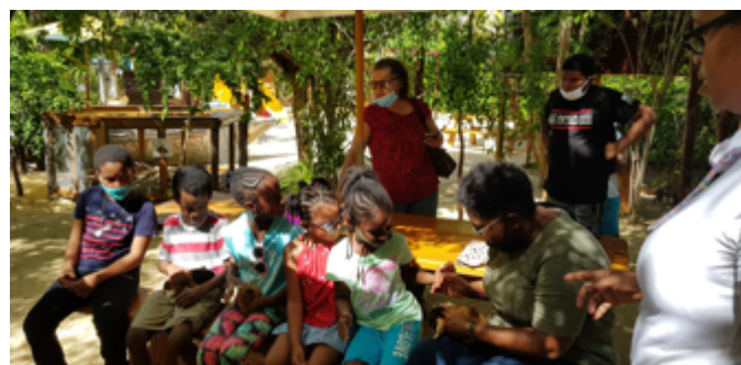
...enjoying the outing and sharing love with some furry friends, too.