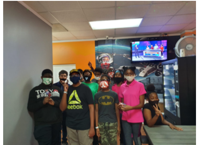
...and later in the afternoon playing a team driven game of Laser Tag at Strike Zone in George Town