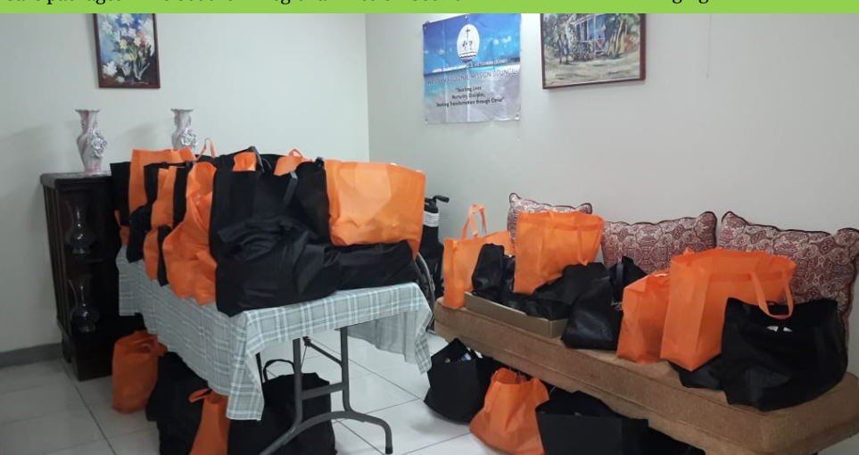
Care packages in the Western Regional Mission Council

Care packages—The Southern Regional Mission Council distribution in his congregation.