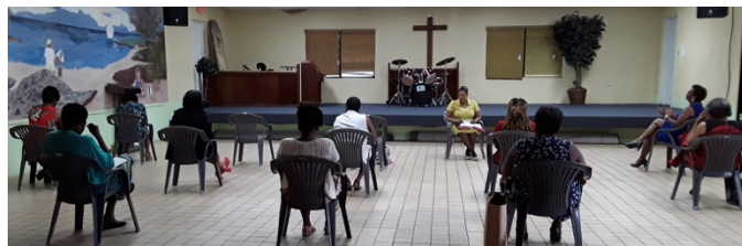
Women’s Fellowship members at Elmslie UC gathered for the ‘Day of Prayer and Fasting’ on Sunday October 18, 2020.