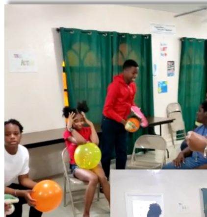
Games with mixed group

The boys were scheduled to go fishing but due to bad weather it was postponed. The evening was well spent, and the boys also had fun playing games.