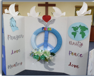
North Side Company

One very powerful highlight of the service was the presentation of the posters made by the girls in each company depicting the light that brings peace and healing to the world.