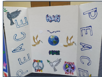
George Town Company