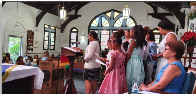
The North Side Company singing a special song