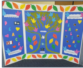
West Bay Company