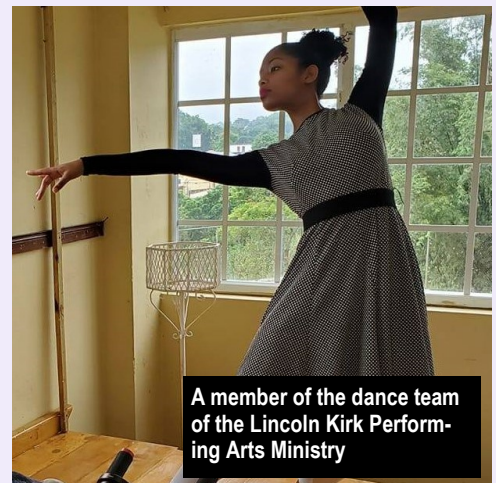
A member of the dance team of the Lincoln Kirk Performing Arts Ministry