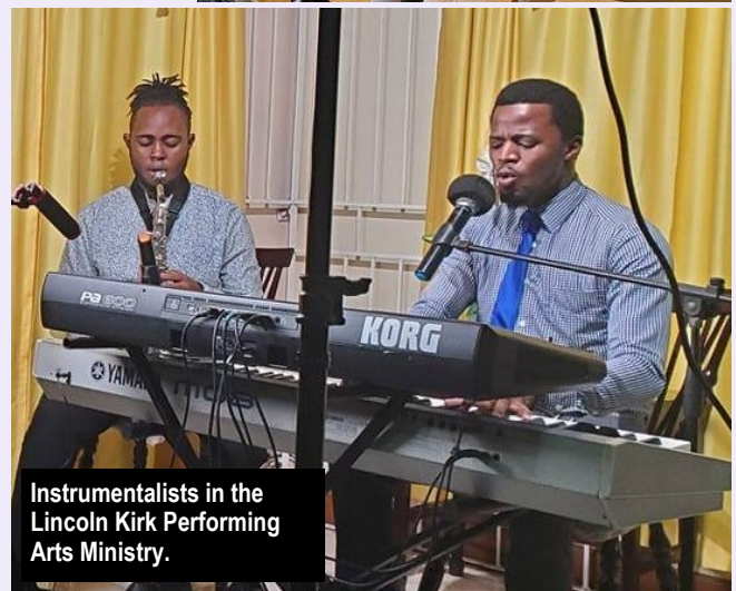
Instrumentalists in the Lincoln Kirk Performing Arts Ministry.