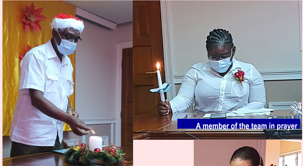
Candle-lighting was a feature of the carol service.