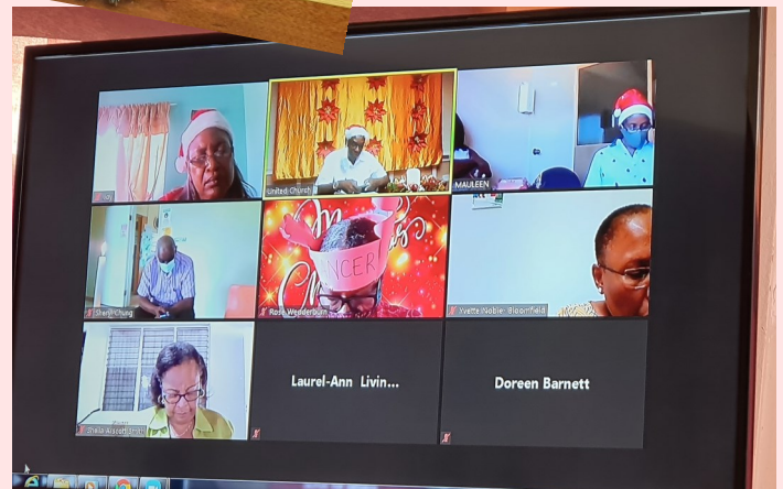
Some team members joined via Zoom platform.