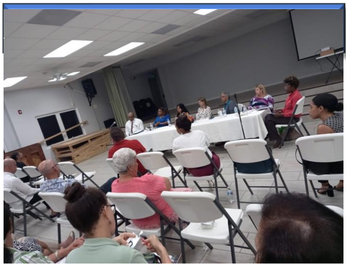
A mental Health Workshop was hosted by the John Gray Memorial Church in West Bay on January 21, 2021.

(https://www.oikoumene.org/news/global-ecumenical-prayer-shows-we-are-one-world-and-one-human-family)