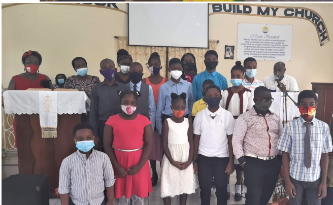
Members of the Youth and Children's Department at Mannings Hill United Church.