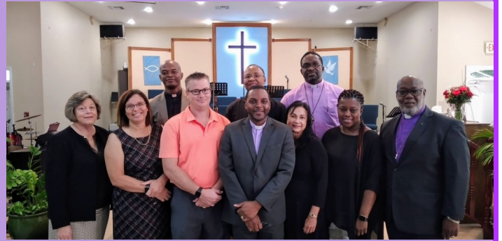
Newly elected Youth Leaders National Executive (left) and Council Executive of Cayman Islands Regional Mission Council (right) were installed. (Below) A view of the congregation gathered for worship at Savannah United Church.