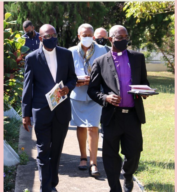
Platform party proceeds to the Memorial Garden.