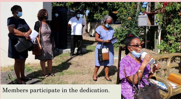
Members participate in the dedication.