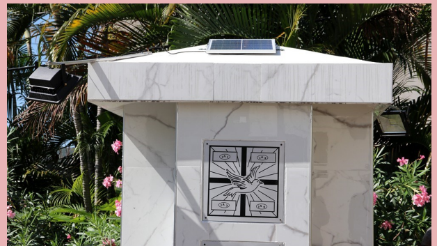
A section of a columbarium tower fitted with solar panels.