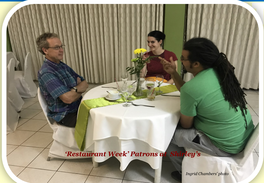
'Restaurant Week' Patrons at Shirley's