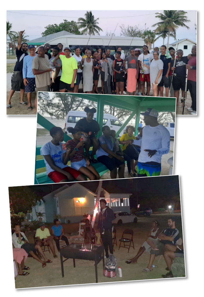
(The group – Fishing Trip – Recommitment Service)

by a time of reflection. Each person was asked to write their confessions and burn them in the bonfire.