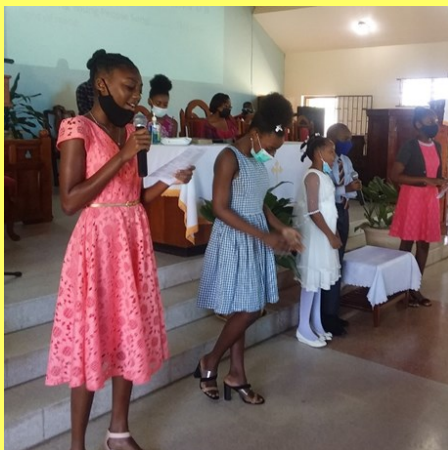
(Left) Children and youths singing the Children Song.