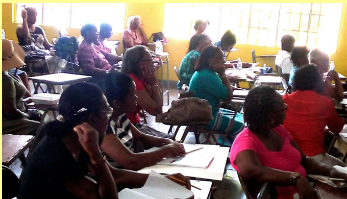
Volunteers for children's ministry in Western Region Mission Council participate in a Child Protection Policy Workshop

The Child Protection Policy takes into account the need for directives surrounding the general safety and care-giving of children as well as physical and interpersonal conduct within the church: on its grounds, within its congregations and in all church-related activities including church services, Sunday or Church School, summer camps and church excursions.