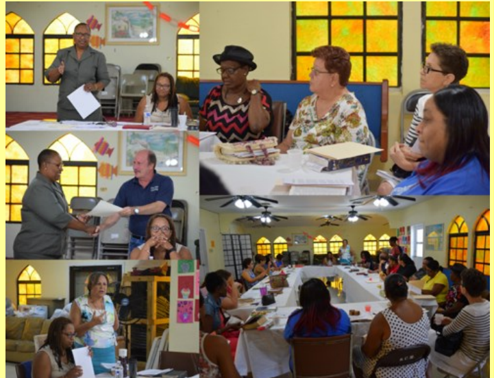
Training in Childcare and Protection was conducted in all councils. Here participants in Cayman learn together.

The Minister of the Charge is the chief accountable officer of the Charge. He/ She is responsible for the leadership, direction and management of the pastoral/ministerial services delivered by the Charge. These responsibilities include authorization for other members of the church participating in formal and informal church leadership at various levels such as teaching Church/Sunday School, leading Praise and Worship, leadership within the Girls' and Boys' Brigade/ Brownie groups. By extension, the Minister will ensure that the policy is accessible to the membership and leaders, is understood by all, and is being observed within the Charge.