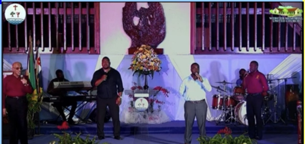
Webster Memorial Men's Chorale renders an item for Mother's Day, Sunday, May 9, 2021.

Photos: Men's Fellowship groups at Lucea United, Webster Memorial in Kingston, and Hope United, demonstrated appreciation for women in Mothers' Day tributes through music.