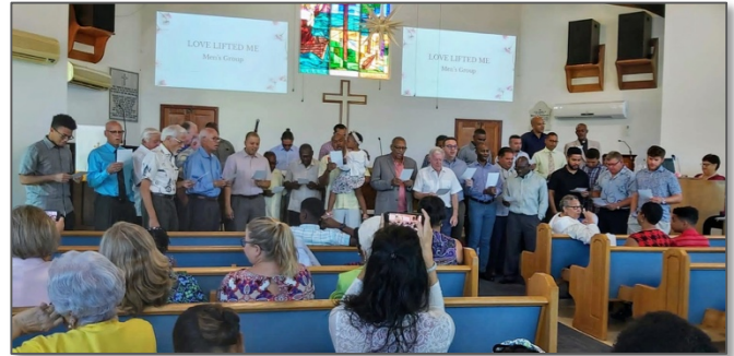
The men of the John Gray Memorial Church singing 'Love Lifted Me' on Mothers' Day.