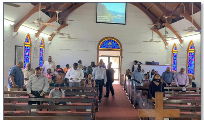
Fathers receive their tokens at the Father's Day Service at the Webster Memorial United Church in Boddin Town.