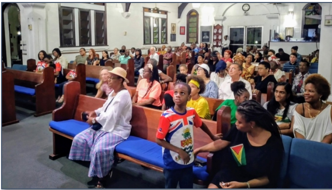
The program included special presentations in the sanctuary

The first ever International Night organized by the Elmslie Memorial United Church Youth Ministry held on Friday, June 25, 2021 was a huge success. Persons from close to twenty different nations call this congregation their home and on this special evening some had the opportunity to showcase their talents, dresses, music and mouth-watering cousins to the delight of those gathered. By all indications, members of the Church and the community are expecting this festivity to become an annually recurring event from now on.