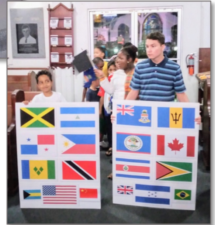
National flags of countries on display representing the diverse membership of Elmslie UC.