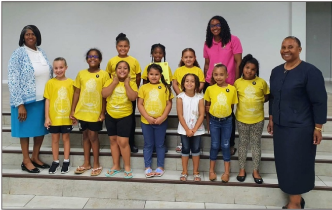
The Explorers with their leaders and the National Chaplain ***