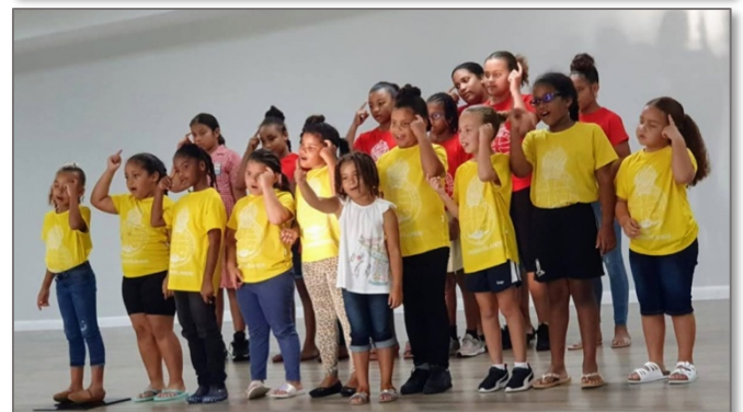
Explorers and Juniors performing at the Awards Ceremony