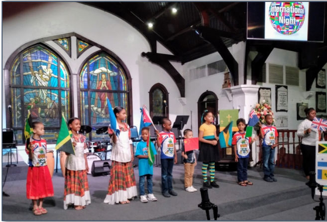
Some of the children with flags representing their countries

The first ever International Night organized by the Elmslie Memorial United Church Youth Ministry held on Friday, June 25, 2021 was a huge success. Persons from close to twenty different nations call this congregation their home and on this special evening some had the opportunity to showcase their talents, dresses, music and mouth-watering cousins to the delight of those gathered. By all indications, members of the Church and the community are expecting this festivity to become an annually recurring event from now on.