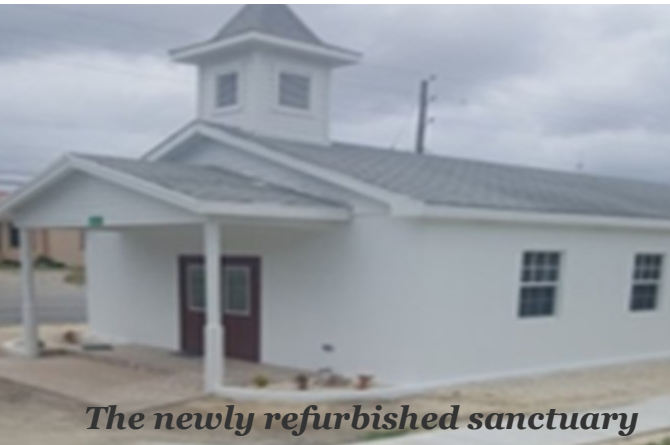
The newly refurbished sanctuary

Send comments and news about your congregation to ucjiupdate@gmail.com