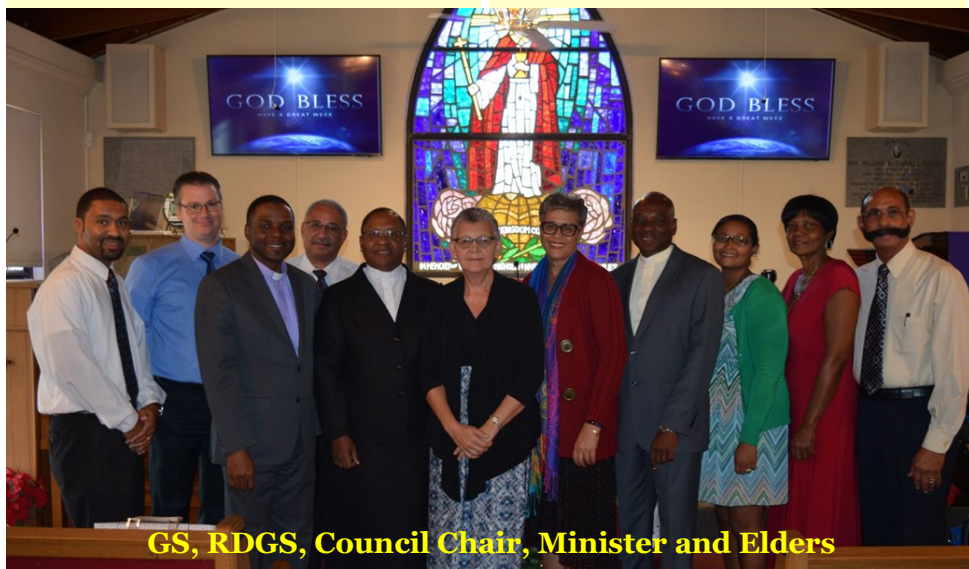
GS, RDGS, Council Chair, Minister and Elders