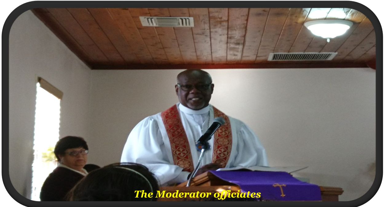
The Moderator officiates