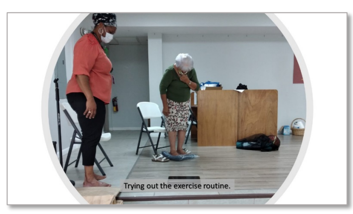
Trying out the exercise routine