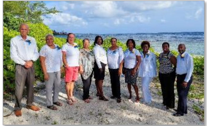
(Ten of the fifteen graduates were able to attend the social)

On Saturday, January 8, 2022, graduating participants from the CIRMC gathered at the Council Office to celebrate the successful completion of Module 1 of the UCJCI Training for Lay Leaders Certificate Course. The fifteen (15) persons receiving certification for Module 1 represented our West Bay, George Town, Savannah, and East End-Gun Bay Charges.