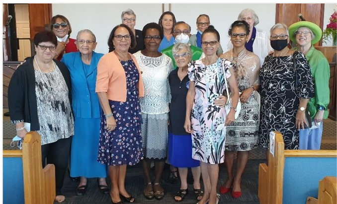
Members of the JGMC Women's Fellowship

With a Call to Worship that reflected on the women of faith of our past, present, and future and underscored by the hymn, "Rejoice, the Lord is King" and "For I'm Building a People of Power" which shone the light on Christ's kingship and reign,