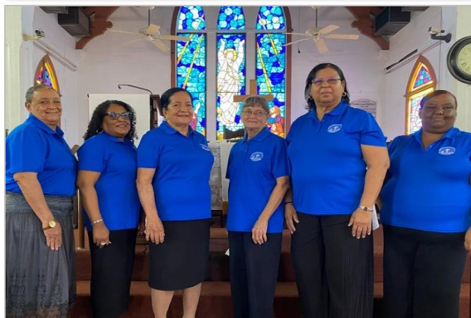
Webster Memorial (Bodden Town) United Church's Women's Fellowship