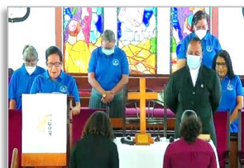
Two youth group members received the offering during the service.