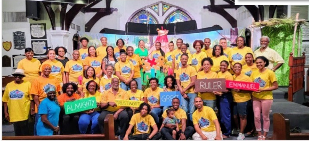
Scenes from Elmslie VBS