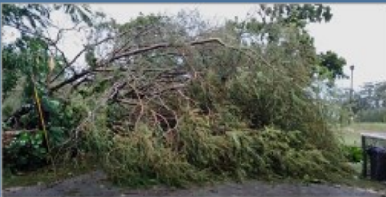
A fallen tree blocking the driveway to the Council Office.

Tropical Storm Grace was a stark reminder of our vulnerability but also of God's Grace. As true Reformed Christians, we recognized early that we would be saved by faith through God's Grace and that the presence and peace of Christ would be with us. For some persons, this was a new experience but for many, it was a recall of hurricanes past.