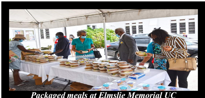
Packaged meals at Elmslie Memorial UC

Laity and clergy prepared enthusiastically for this special occasion. Preparations were in their final phase when on last Friday a Covid-19 positive case was confirmed in one of our communities, raising alarm island-wide. Some of the congregations scaled back on their plans, shortening their service or cancelling the fellowship meals altogether.