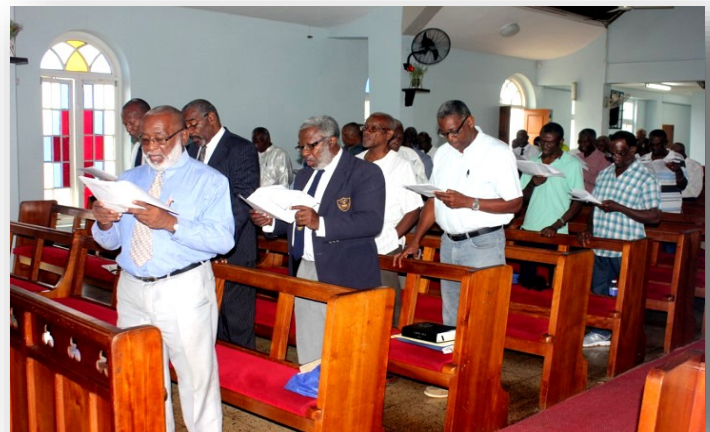
2020 Men’s Fellowship Convention at the Ridgemount United

“Lift High the cross of Christ! Tread where His feet have trod As brothers of the Son of Man