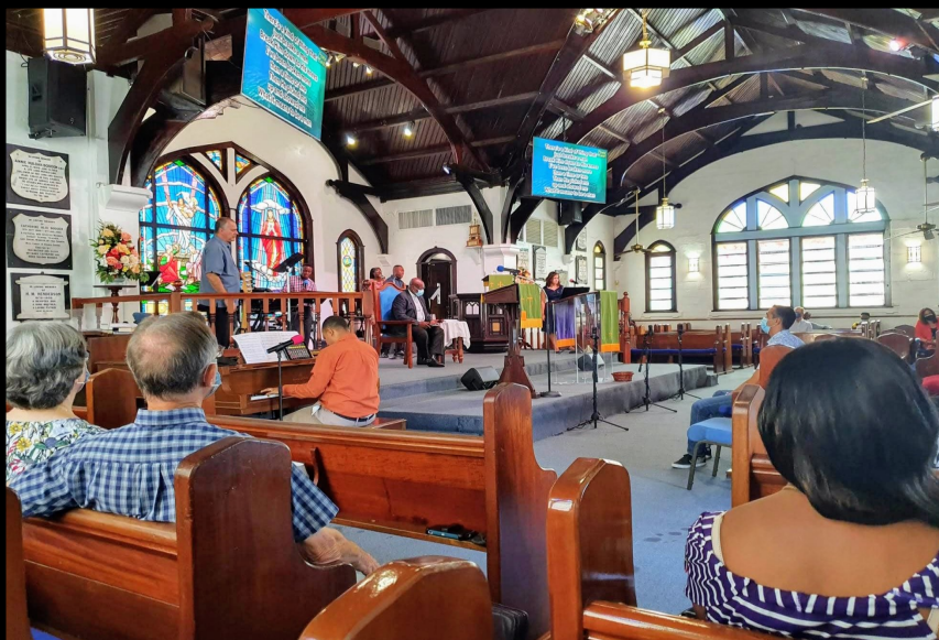
Elmsie Memorial United Church

I call on you, my God, for you will answer me; turn your ear to me and hear my prayer Amen.