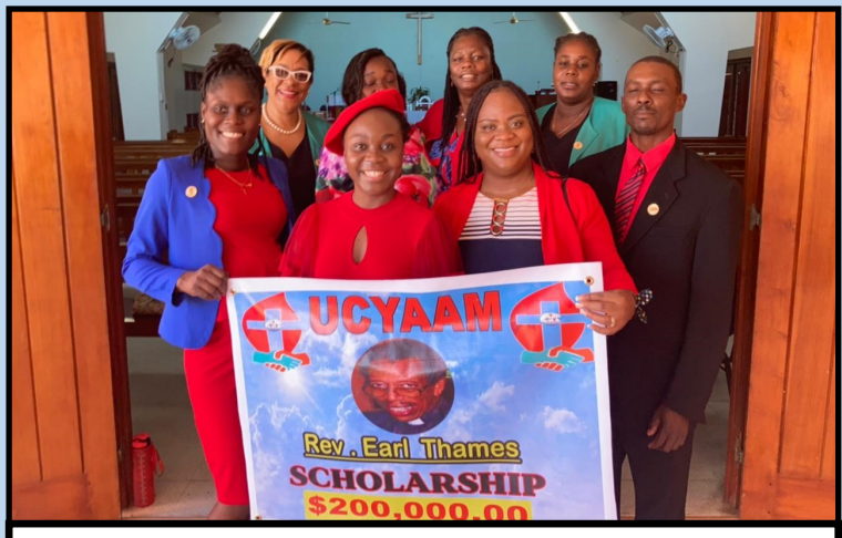
The Launch of the Earl Thames Scholarship.

The United Church Young Adults' Action Movement, UCYAAM, Synodical Executive extends our appreciation to everyone who participated in our recently concluded virtual crusade. Special thanks to our speakers, congregations, Ministers and young adult leaders who facilitated this worship experience. We also wish to extend our thanks to the Minister and members of Savanna-la-mar United Church for hosting our Annual Church Service on Sunday January 16, 2022. Special thanks is also being extended to all our viewers, we pray that you were blessed and challenged to a life committed to Christ.