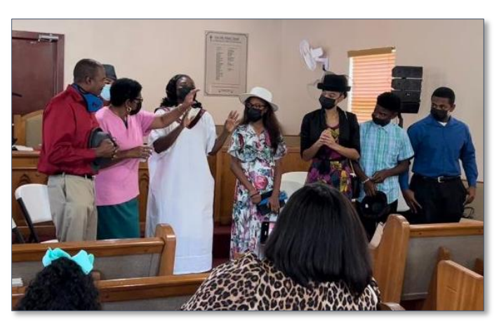
Mother's Day skit at the Gun Bay United Church