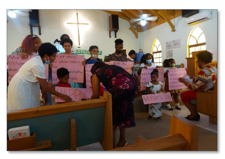
Mother's Day recital at the East End United Church

the Church reminded them of the Christian duty of helping others in need.