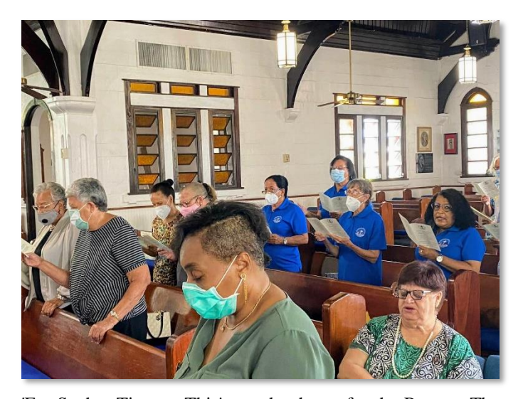
For Such a Time as This' was the theme for the Retreat. The RDGS provided the Reflection on the theme, based on Esther 4:1-17.

The Cayman Islands Women's Fellowship held its Annual Retreat on Saturday, June 11, 2022, at the Elmslie Memorial Church.